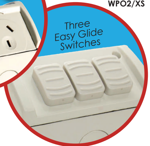
Three Easy Glide Switches