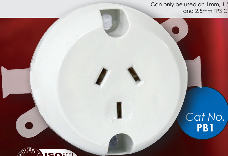
Cat No. PB1