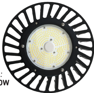
Cat No: GHB120W