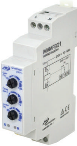
Under/Over Voltage Relay • 1PH 230V • Application:- Supply Voltage Monitoring Cat No: MVMFBD1