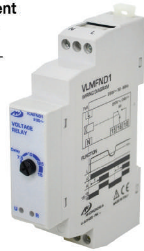
Under Voltage Relay • 230V • Application:- Monitoring Voltage Cat No: VLMFND1