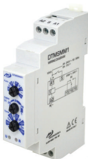
Multifunction Delay Timer • 24-240V • Application:- Automation Control Cat No: DTMSMM1