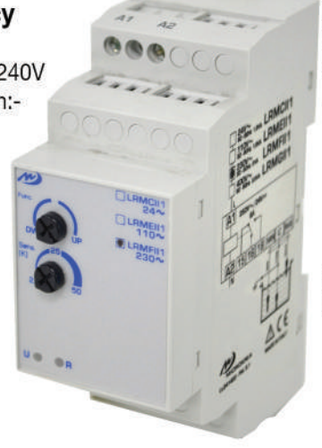
Liquid Level Controller • 230V • Application:- Control and Maintenance of max/min level of conductive liquids Cat No: LRMFII1