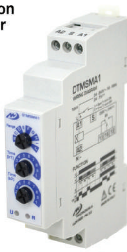
Programmable Asymetrical Timer • 24-240V • Application:- Automation Control Cat No: DTMSMA1