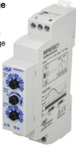
Frequency Monitor • 50 HZ 24-240V • Application:- Genset Systems Cat No: MFMFBD1