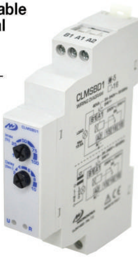
Over Current Relay 5A • 24-240V • Application:- Max Load Control on Conveyors Cat No: CLMSBD1