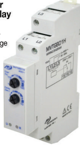
Over Voltage Relay • 3PH 400V • Application:- Supply Voltage Monitoring Cat No: MVTGBD1H