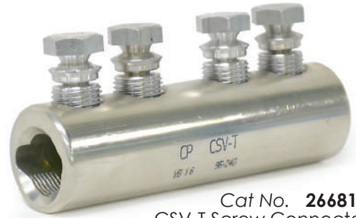
Cat No. 266811 CSV-T Screw Connector

95-240mm 2 cable. Aluminium tin-plated material.