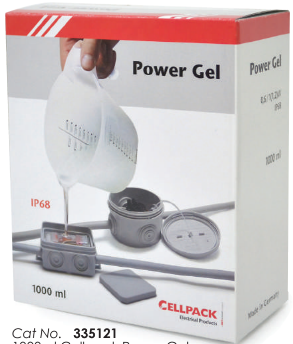
Cat No. 335121 1000ml Cellpack Power Gel

Kit includes: Power Gel component A Power Gel component B Measuring Cup and Spatula