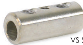
Cat No. 126214 VS Screw Connector